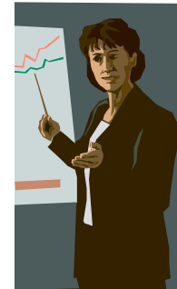
Microsoft Office Clipart